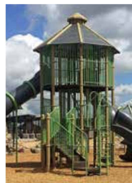
Jordan Ranch – Brookshire, Texas