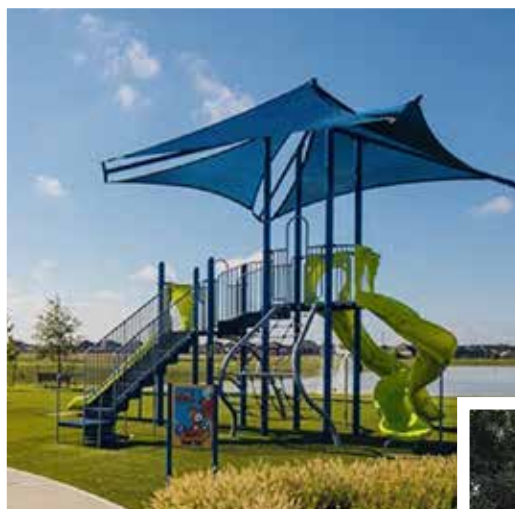
Wildwood at Oakcrest – Tomball, Texas

Each project that May Recreation works on is unique and customized based on the client's specific needs, space and budget. Here is a sampling of playgrounds we've completed recently. We're happy to provide more examples and pictures of playgrounds we've completed at schools, communities, churches and residential neighborhoods.