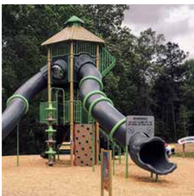
Kingwood Royal Brook – Kingwood, Texas