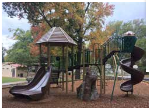
Emmett J. Scott Park – Tyler, Texas