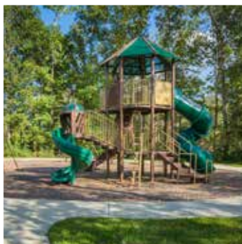
Tavola, Phase 1 – Friendswood, Texas