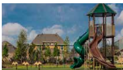
WoodTrace – Tomball, Texas